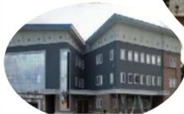
ULTRAL MORDEN LABORATORY COMPLEX