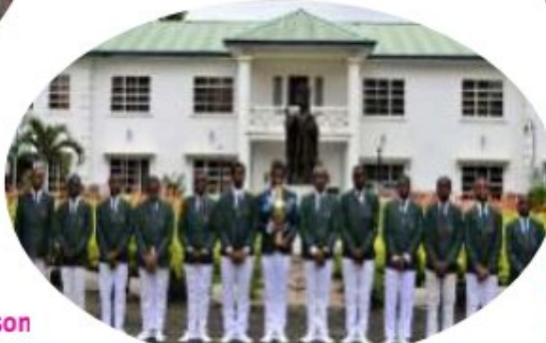
WINNERS 2017 NATIONAL HELMBRIDGE SCIENCE CHALLENGE